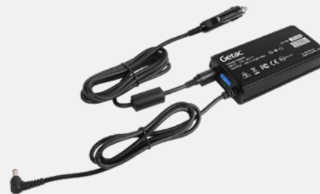
Cigarette Lighter Plug Version